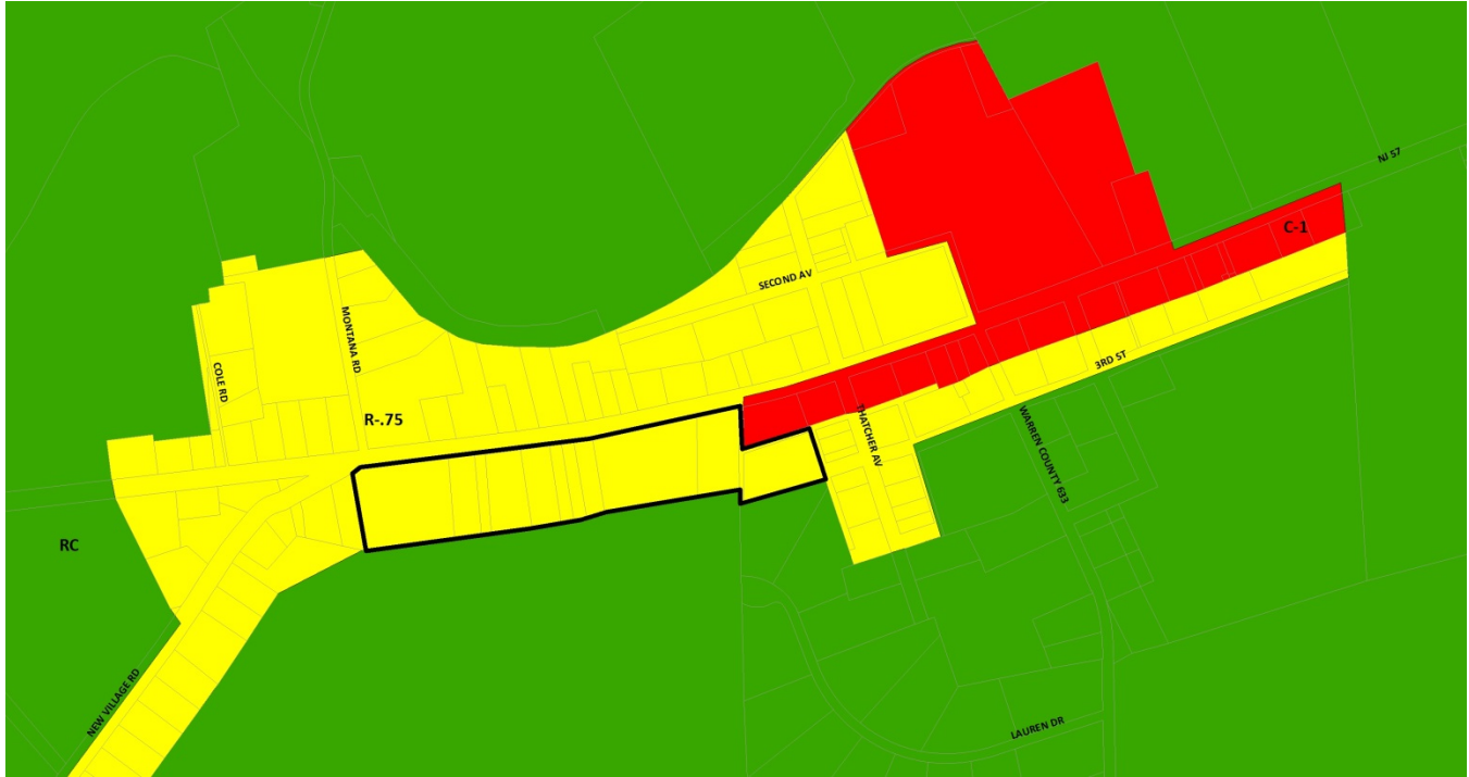
Figure 2 – Current Zoning

As outlined in the Schedule of Use Regulations in the Land Use and Development Ordinance, permitted uses in the R-75 Village Residential District include single-family detached dwellings, agricultural uses, public utility structures and civic buildings. Accessory uses permitted include signs, home occupations, home professional offices, private tennis courts, bed-and-breakfast inns, accessory apartments, small wind energy systems, renewable energy facilities and any use or structure customarily incidental to principal permitted uses. Conditional uses permitted include churches and educational uses, wireless telecommunications antennas placed on existing structures and wireless telecommunications towers.