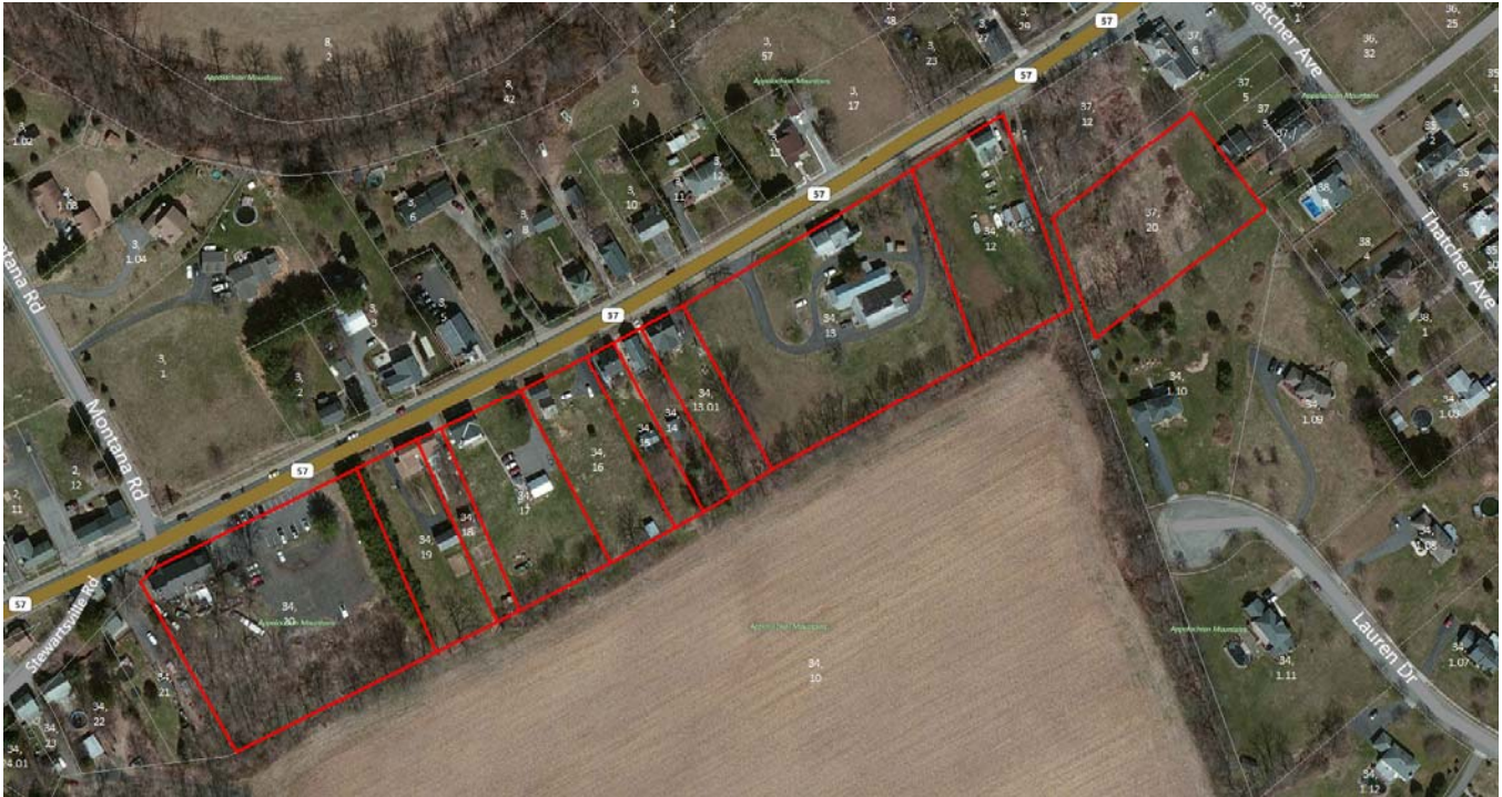
Figure 1 – Study Area Parcels

The area in question includes eleven (11) parcels located on the south side of Route 57 just east of Stewartsville Road, currently situated in the R-75 Village Residential Zone. Figure 1, below, shows the parcels in the study area outlined in red, while Table 1 lists each parcel.